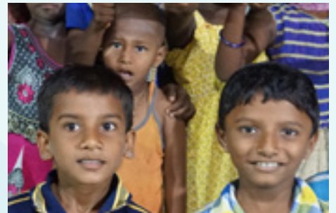
Right: Some of the happy children at the Good News Children's Centre in Nandiwada, Andhra Pradesh, India.