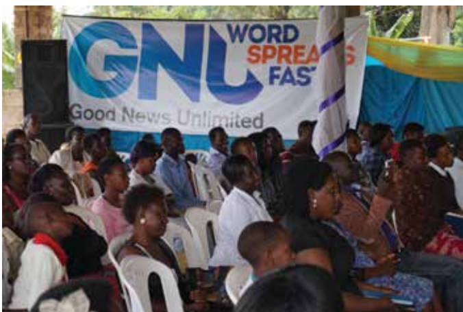
Word Spreads Fast in Africa.

... seeing for myself how much this ministry has grown in only twelve months ... was absolutely thrilling.